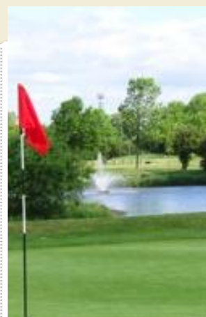
Riverside Course, Trent Lock